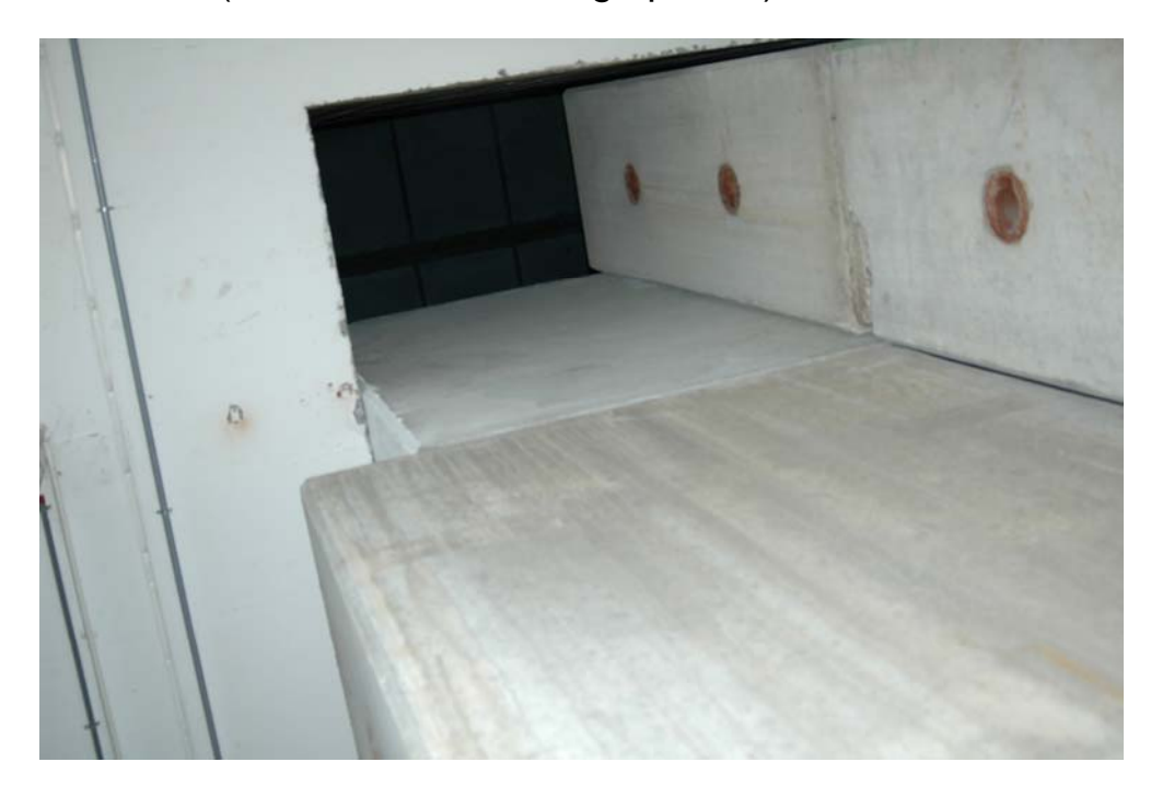
Going down, down ... (in fact we are looking up here)